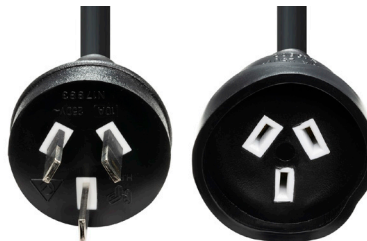
Standard Duty, Black