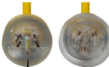
Heavy Duty, Yellow