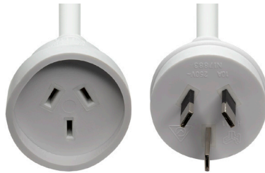
Standard Duty, White