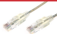
PLS-C6-1.5 1.5m Cat6A 10G Beige Slimline Component Level UTP Patch Lead (30AWG). Various lengths