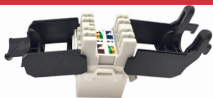
FP-C6AUTP-TLWH Cat6A Class EA 10G UTP Keystone Slimline Tooless & Punch Down Compatible Jack