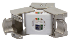
Cat6A Class EA 10G Shielded Keystone Slimline Jack. To use with PP-UKSTP-24RM.