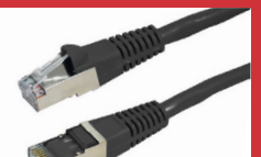
PLK-AUGS-1H 1.5m Cat6A Black SFTP 10G Patch Lead. Various lengths

Please note we took the up-most care to compile the information in this datasheet. To the best of our knowledge all info provided were correct at the time of creation. Should any specs change we try to update info accordingly. Information are subject to change without notice. In the case that you find any irregularity please inform our team at contactus@dynamix.co.nz