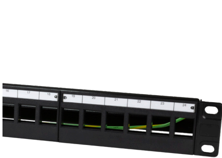
PP-UKSTP-24RM Front View