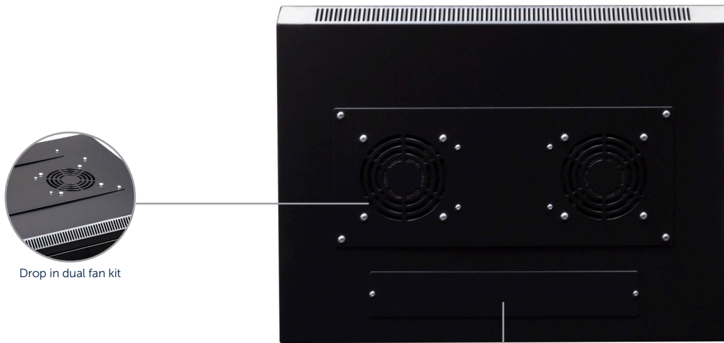
Top and bottom cable entry