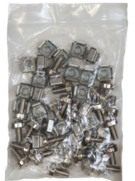
Includes cage nuts